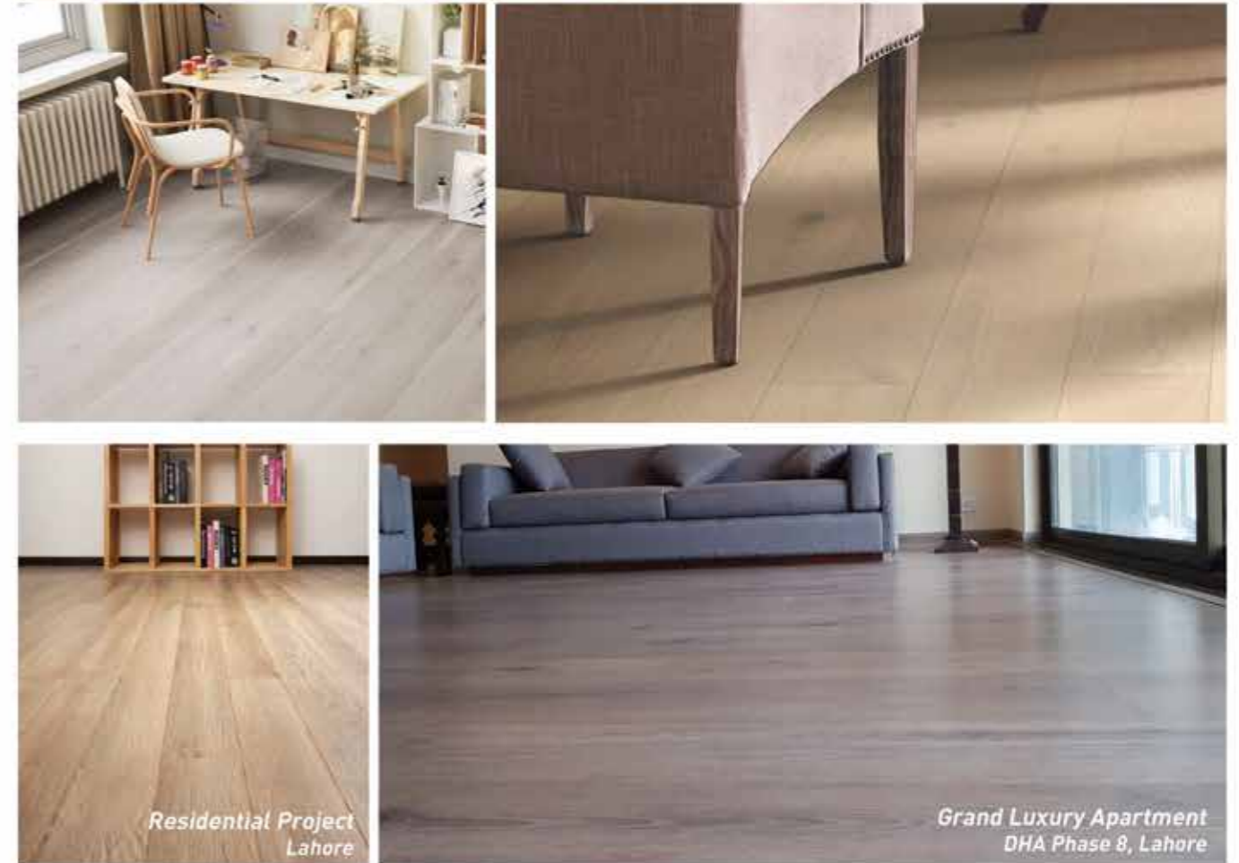
Residential Project Lahore